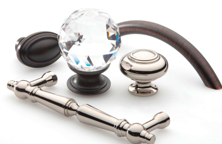
Baldwin Hardware's Estate collection of decorative hardware offers signature looks with a wide range of customizable styles and finishes. Master craftsmen create each piece by hand. Circle No. 196 on Product Card