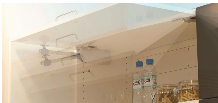
The SLS-ELAN from Sugatsune America employs soft-close, free stay and lift assist for upward opening doors, and emphasizes easy installation and slim body profile. To prevent slamming, the SLS-ELAN is equipped with the patented Lapcon damping system. Past certain angles, ELAN offers a free stay so opening the cabinet door to the maximum angle is not necessary. Circle No. 214 on Product Card