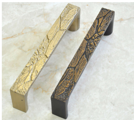
Hardware Renaissance's Canyon collection handle pulls are based on textures reminiscent of the Grand Canyon, according to the company. The handcrafted pieces are highlighted with white bronze or shaded silicon bronze. Circle No. 206 on Product Card