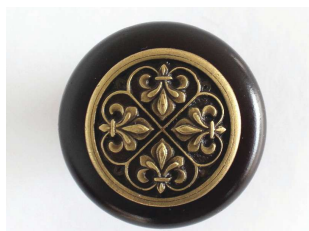
This Fleur-De-Lis Wood Knob from Notting Hill Decorative Hardware plays on the trend toward warm metal and wood finishes in the home. The knob is shown in a Dark Walnut finish with Antique Brass decorative details. Circle No. 210 on Product Card