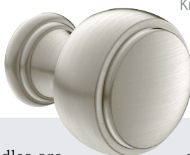
Knob accents include porcelain inlays that feature Euro-influence decorative script and signature styling elements. Circle No. 207 on Product Card