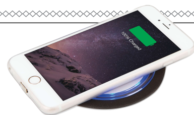
A Qi compatible device can be placed on the Wireless Charging Grommet surface from Doug Mockett & Co. for an automatic charge. The charge is indicated by the luminous ring of lights on the cap. Circle No. 208 on Product Card