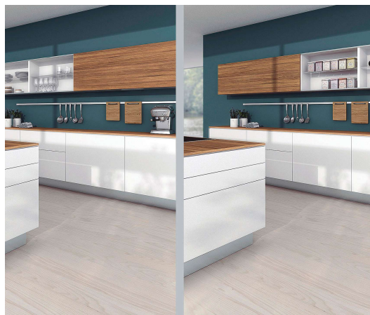
The SlideLine M sliding door fitting from Hettich America is a system that can be used for many applications. Silent System is integrated in SlideLine M's running component and moves doors gently and quietly in opening and closing direction, the company reports. The single-track, bottom running SlideLine M sliding door fitting is suitable for all common furniture designs and doors made of wood, glass and aluminium weighing up to 30 kg. Projecting by just 8 mm, the profile keeps sliding doors close to the carcass, guaranteeing minimal gaps at either side. Two doors can cross each other in just one profile. Circle No. 192 on Product Card