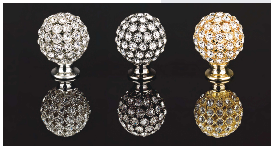
The Swarovski Crystal All That Glitters Collection from Topex Design features 15 distinctive knobs and six pull handles. The Swarovski Crystal knobs come in shapes that resemble large diamonds. Knob crystal shapes include the round-cut Crystal Ball, the four princess-cut crystals of Cuff Link, the emerald-cut Lights On and the old-European-cut High Gear. Diamond Bar, the pull handle, is set with nine princess-cut crystals. Circle No. 190 on Product Card

In functional accessories, there is a surge in items that have a customized use, says Shari McPeck, marketing manager at Rev-A-Shelf, LLC in Jeffersonton, KY, such as storage designed specifically to hold food storage containers, or designed for use in a beverage center. "It seems people are starting to really look inside the cabinet at trouble areas and are requesting specific fixes," she says.