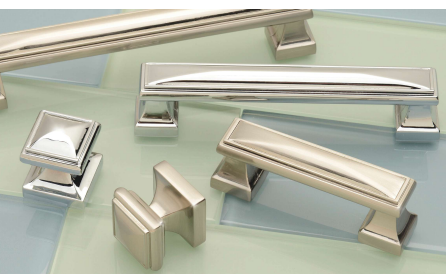
Classic style is reflected in the new Wadsworth Collection of decorative hardware from Atlas Homewares . The timeless look is showcased in the detailed moldings, from the flared feet and beveled edges to the slightly arched face plate. The Wadsworth collection is available in four finishes – Brushed Nickel, Polished Chrome, Champagne and Vintage Brass. Circle No. 209 on Product Card