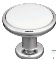
Porcelain Insert Knobs from Stanley Hardware sport a sleek, classic style. The knobs measure 1-1/4" in diameter and showcase a polished chrome finish. Circle No. 195 on Product Card